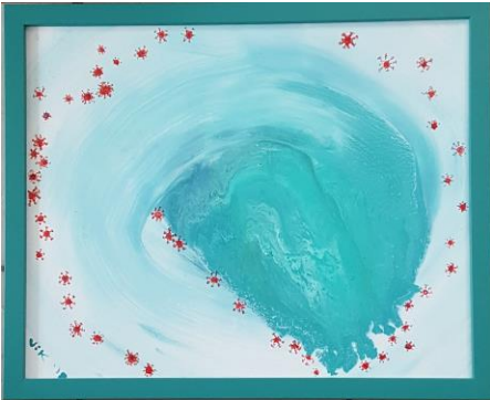
"Dance of Death / Wave of Fear"

This painting shows my feelings about the COVID - 19 pandemic which none of us in the world has ever experienced – a surreal and frightening time where we are challenged to be creative and work together as we never have before. Driving along a Georgina road, I noticed this unused barn, which fell last summer in a windstorm. Symbolic of our current reality, I felt moved to paint the image.