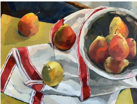
“Gramma’s Tea Towel”

The online show will remain online for the month of April. All work is for sale. Please contact Shelley Ware sware@aurora.ca if you are interested in purchasing a piece.