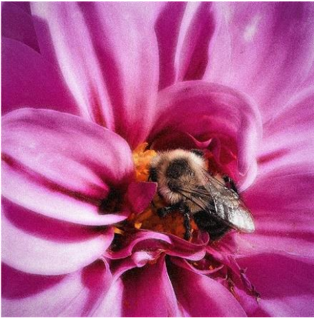
"Just Carry On"

Sibernie James-Bosch Digital photo art $225