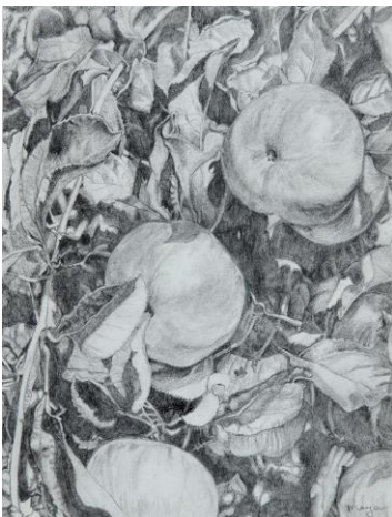
“Innocent and Desirable”