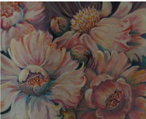
"Peony Show Down"

This artwork is of the beautiful Historic Gardens in the Annapolis Valley in Nova Scotia. When I took the photo of these flowers, I just knew I needed to paint them.