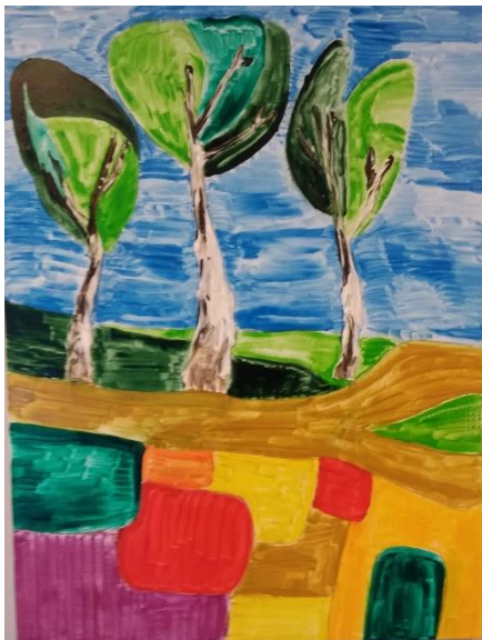
"Spring Landscape Shepherds Bush"

Life is rather fuzzy right now. Drawing upon our true nature from deep within, we discover a wellspring of love, beauty and resilience.