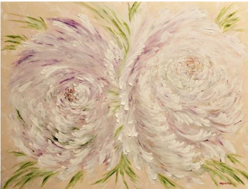
"Wind of Babylon"