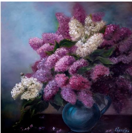
"Bee Happy. May"

The piece was made as a direct response to our world crisis and the need to share brightness through bleak times.