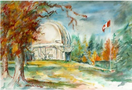
"David Dunlap Observatory, Richmond Hill"