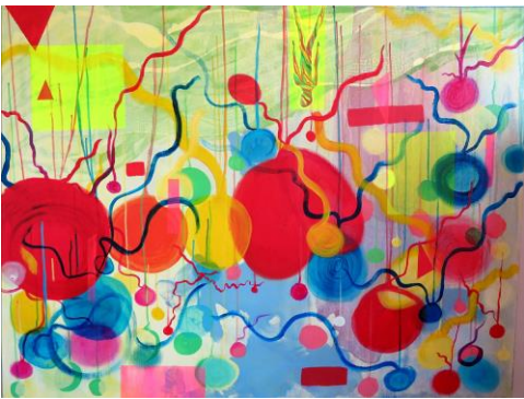
"It's My Party"

Rosie Schroder (16" x 16") Watercolour $225